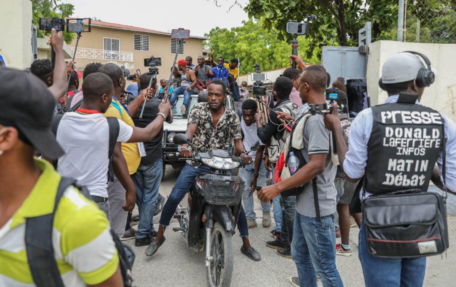
Supporters of Haitian politician Youri Latortue sit atop his car in Port-au-Prince as he leaves following a hearing in the wake of President Jovenel Moïse's assassination.

With the storming of the United States Capitol in January marking a new low in the relationship between a segment of the US population and mainstream news media, we ran a confidential email group to allow news organisations to exchange real time information on events in Washington from January 6 through to Inauguration Day.