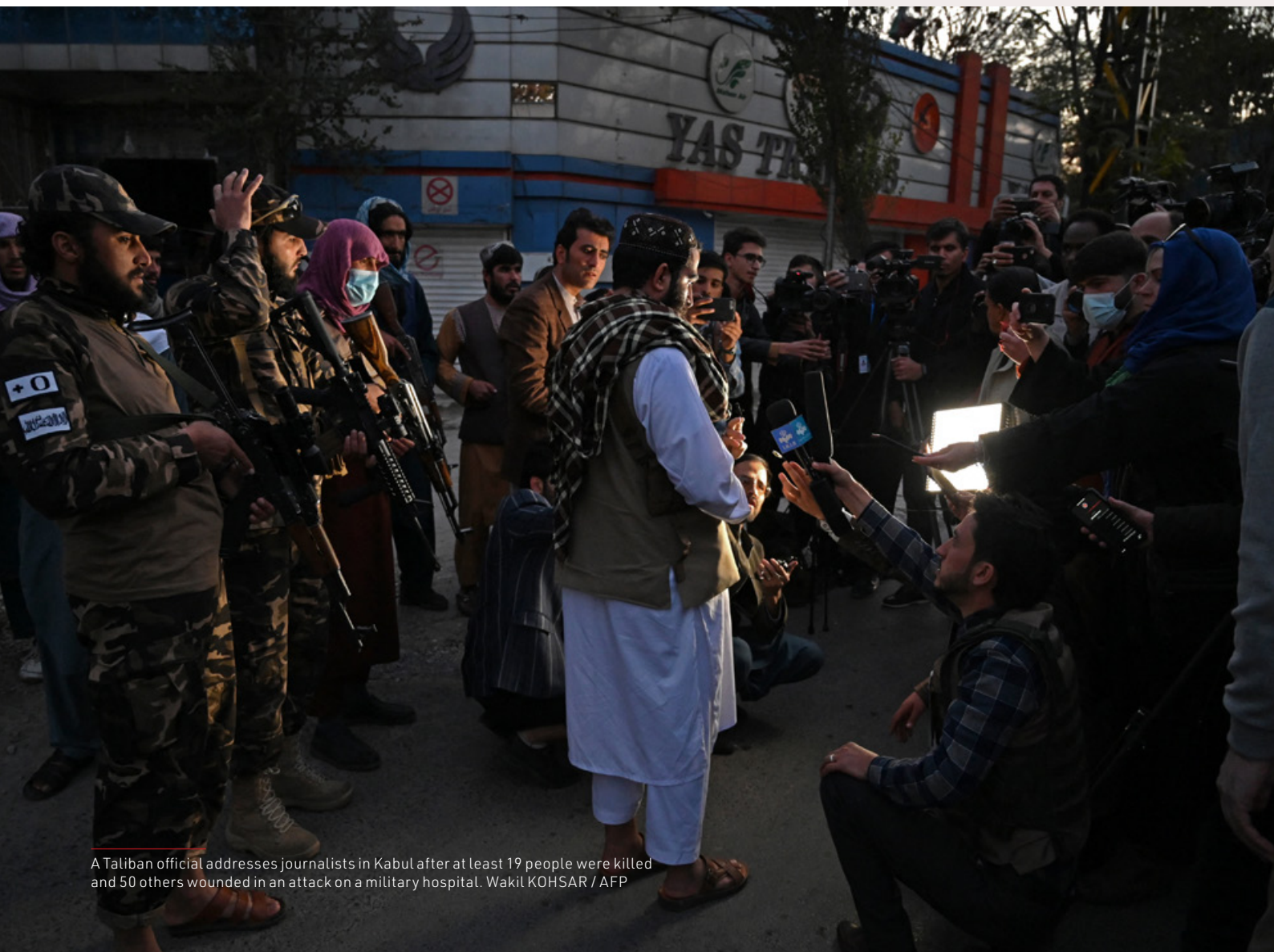
A Taliban official addresses journalists in Kabul after at least 19 people were killed and 50 others wounded in an attack on a military hospital.

INSI has continued to strengthen INSI's structure by hiring team assistant Tommy Hodgson, who covers both administrative and editorial tasks. We have enjoyed working with Tommy to improve INSI's processes and structure to better support and expand all our activities for the safety of our members.