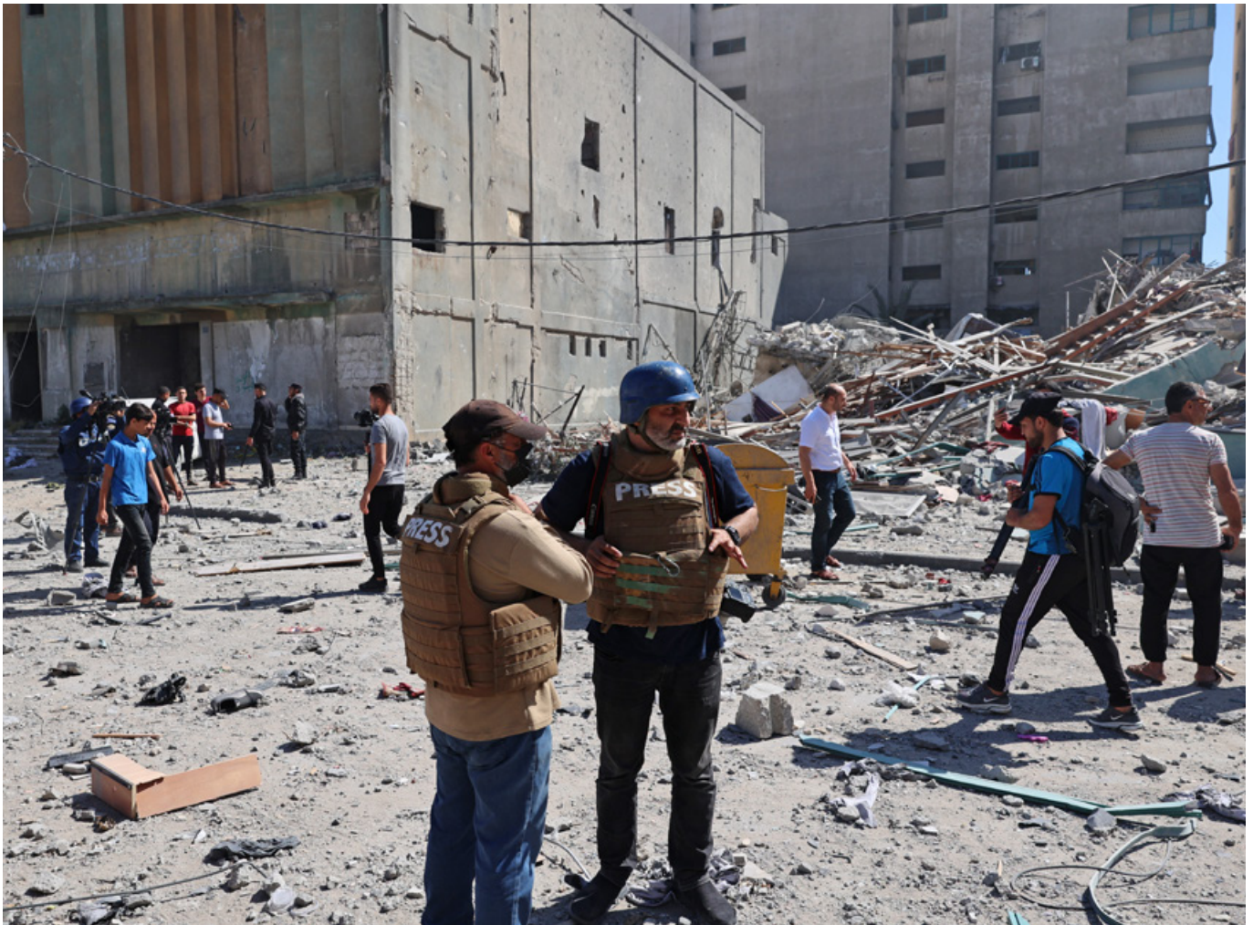
Associated Press journalists stand in shock next to the rubble of their offices in Jala Tower following an Israeli airstrike in Gaza.

In another well-attended event, an international correspondent from a digital member outlet shared an exclusive and detailed account of his team's safety issues and protocols while on a high-risk embed with anti-Al Shabaab forces in Somalia.