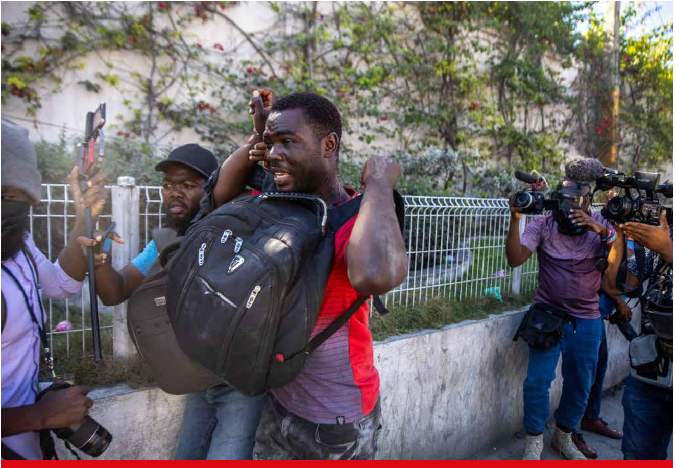
A journalist is escorted to safety after being hit by a stone during a protest by factory workers in Port-au-Prince, Haiti.

nuclear plants, we organised expert sessions on the risk and mitigation options in the event of an attack.