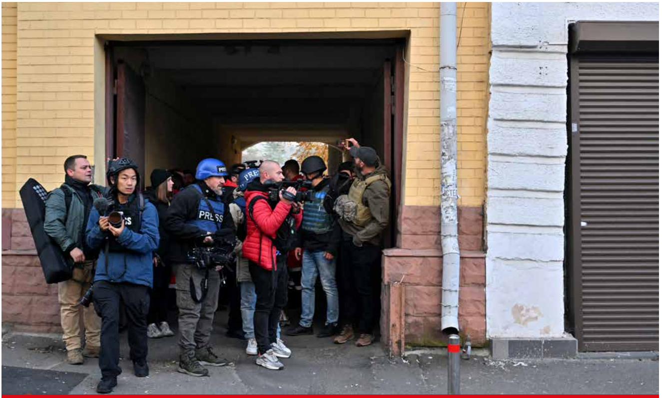
Journalists take shelter during a drone attack in Kyiv.

Members told us our masterclasses and briefings with experts on mitigating risks on the frontline and the broader strategic implications of the war were also highly useful to keep their training and practices up-to-date and their teams safe. As concern grew over the possibility of chemical or nuclear weapons deployment, as well as the safety of Ukraine's