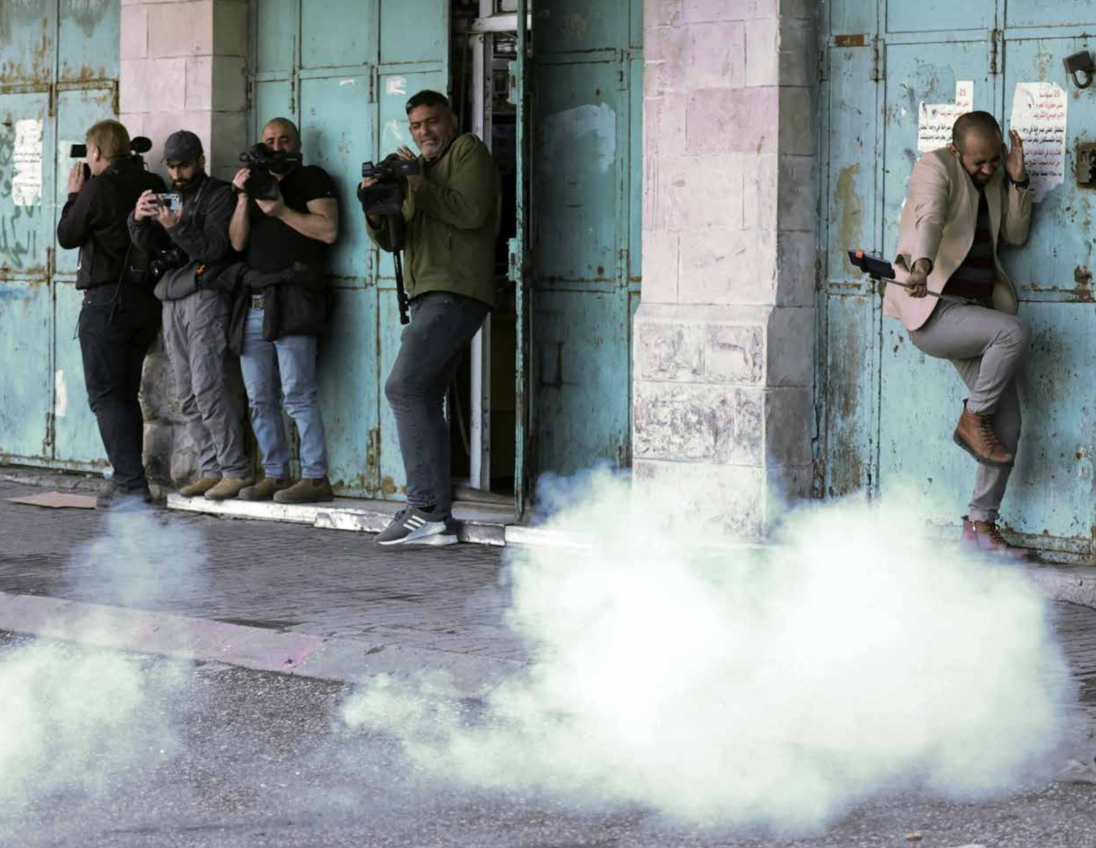
Journalists react to a sound grenade as they cover clashes between Palestinian protesters and Israeli security forces in the West Bank town of Hebron.