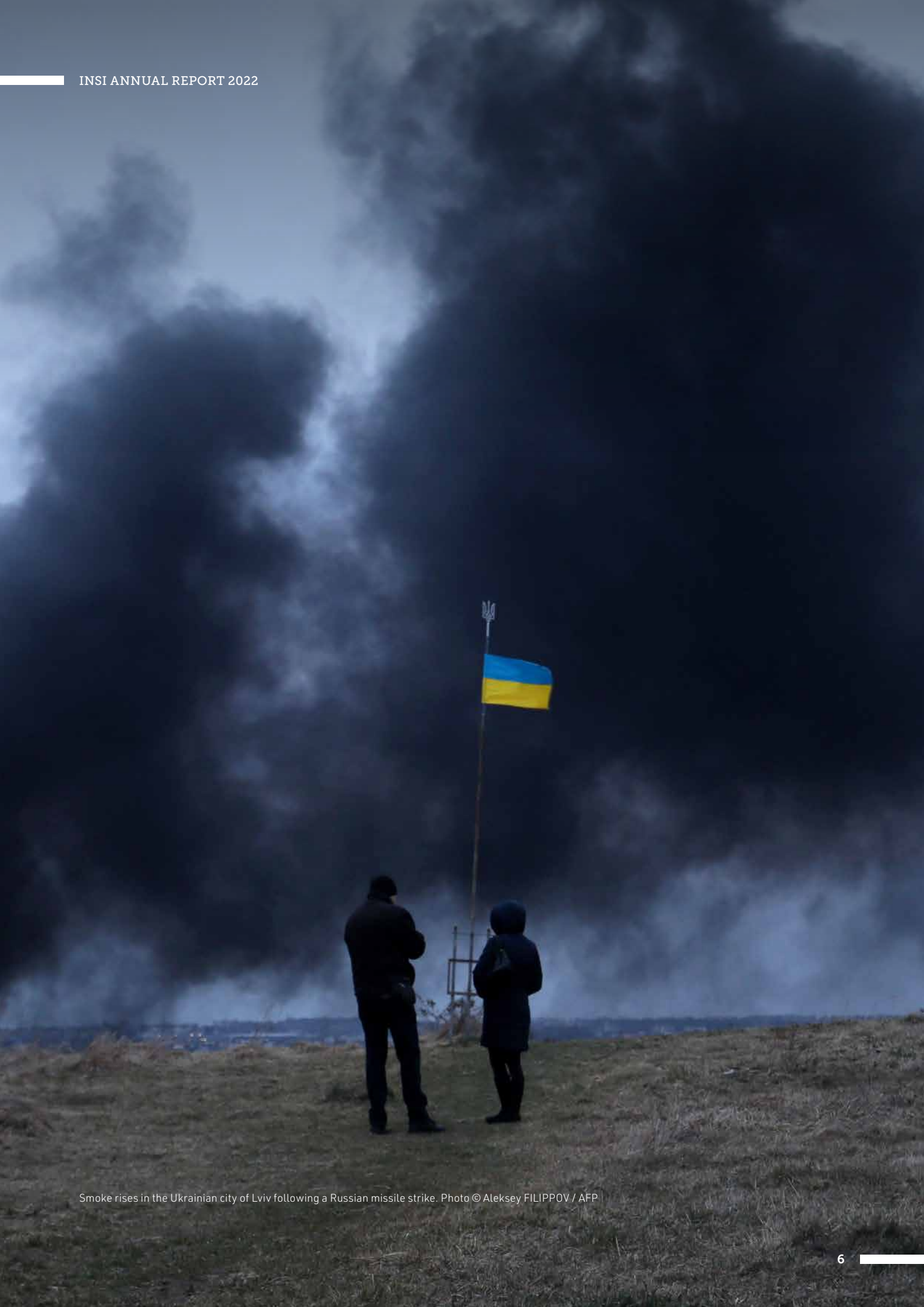
Smoke rises in the Ukrainian city of Lviv following a Russian missile strike.