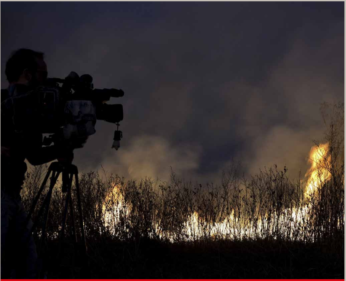
Wildfires raging through wetlands in islands in the Paraná Delta in Argentina.

INSI is determined to respond to the changing and diverse needs of the news organisations that make up our network. Members' surveys, from tracking devices to future deployments also provided us with useful insights for planning future activities.